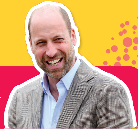
HRH Prince William | Founder and President of The Earthshot Prize November 5, The Earthshot Prize Awards 2026, Rio de Janeiro

We can protect our beautiful planet for all life that call it home, the choices we make during this decade will define us, but more importantly they will define the lives of young people.